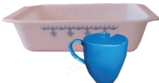
Pet waste & kitty litter