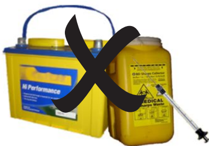
No hazardous & medical waste