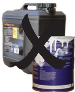
No paint & oils

Visit Council's website to find out how to manage these wastes.