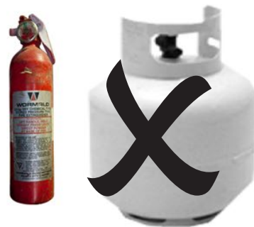
No fire extinguishers & gas bottles