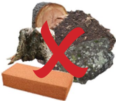
No building materials & stumps

Visit Council's website to find out how to manage these wastes.