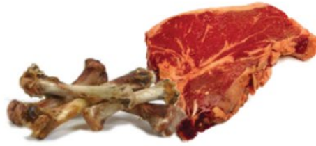
Meat & bones