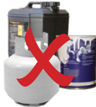
No gas bottles & paint