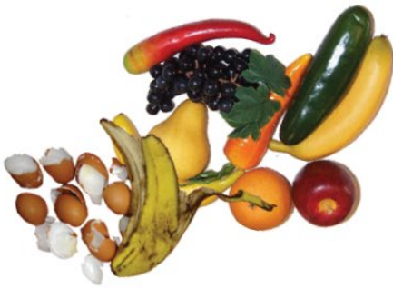
Fruit & vegetables

Collected weekly (get the FREE WasteInfo app at pmhc.nsw.gov.au/bins ).