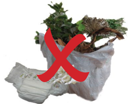
No plastic bags & nappies