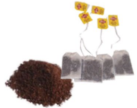
Tea & coffee